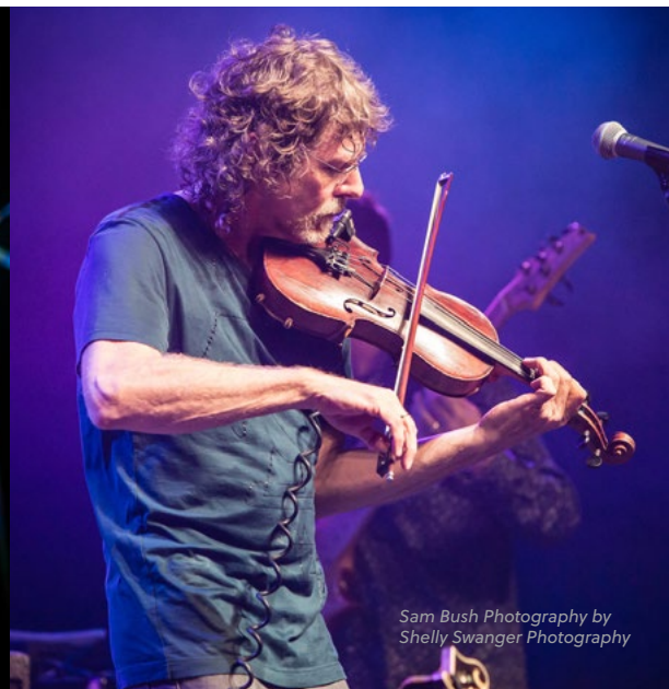
Sam Bush